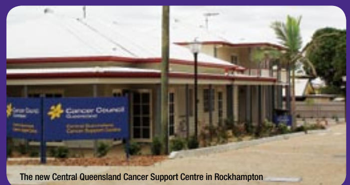
The new Central Queensland Cancer Support Centre in Rockhampton

Both facilities were jointly opened by the Chairman of Cancer Council Queensland, The Hon. Justice Richard Chesterman RFD, and the Deputy Premier and Minister for Health, The Hon. Paul Lucas MP. 📍