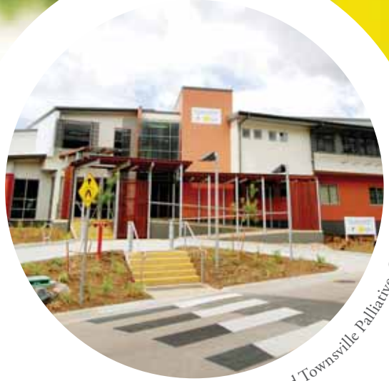
Cancer Council Queensland Townsville Palliative Care Centre

With thanks to our bequestors, we will continue to look for new ways of providing special support when cancer patients need it.