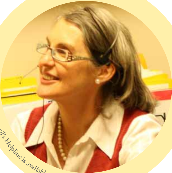
Cancer Council's Helpline is available throughout Queensland