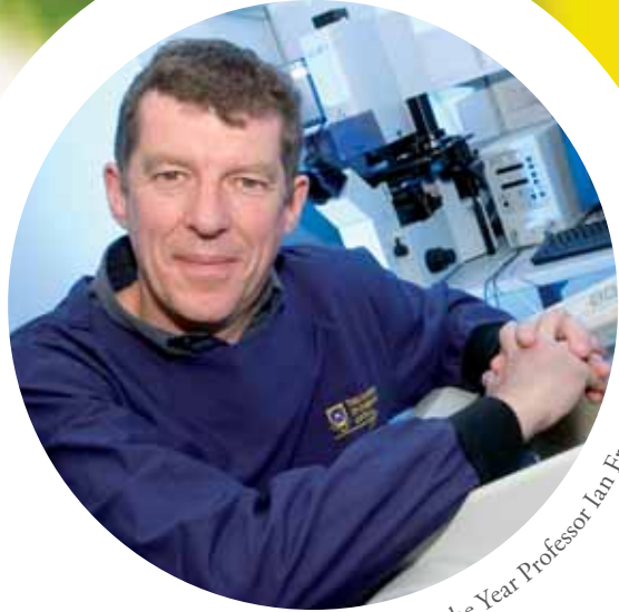
Former Australian of the Year Professor Ian Frazer

breakthrough will prevent thousands of young women from developing cervical cancer. Professor Frazer understands how important bequests are to ensure long term funding for his research projects: